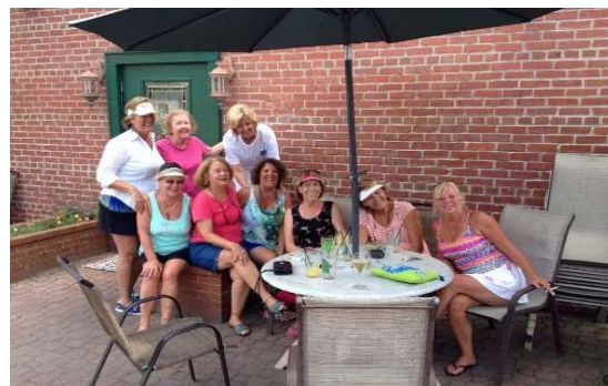
Or maybe it was the ladies that found the bar

Thursday (23 rd ) at Onancock, also on the eastern shore ... lovely small town nice restaurants, great shops, but no pool. But, who cared? There was an Irish pub. Beautiful creek cruise up to the town. We were impressed.