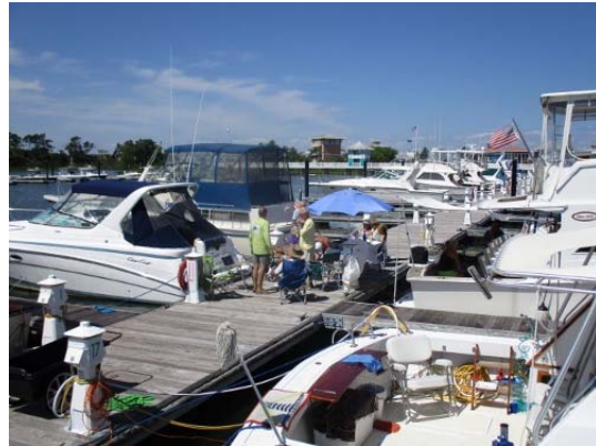
Wednesday Pot Luck Breakfast