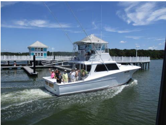
Members leaving on fishing boat