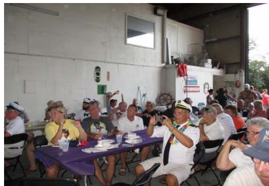
Large shed used for several events

Thirty-six WYA members and one guest attended the Float-In and competed for the PRYCA CUP. We had a superb time but came in second place for the coveted CUP. As the Commodore already noted, we lost by just 1 point. Very close and there were two rules that got modified a bit in the games which just may have cost us a point or two. Not whining, just trying to explain that the games were exciting and close. Good sportsmanship on behalf of the two top clubs (us and Mt. Vernon) ensured all stayed in good spirits.