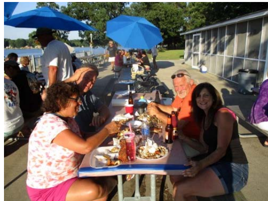
Part of the gang eating crabs