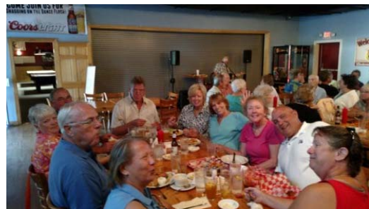
Eating out in Kilmarnock