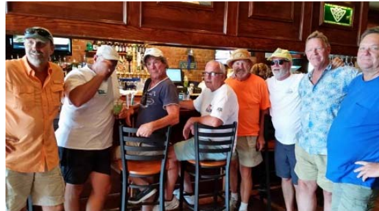
The fellows found an Irish bar in Onancock

Tuesday and Wednesday (21 st and 22 nd ) at the Oyster Farm at Kings Creek in Cape Charles, Virginia, on the eastern shore ... restaurants, golf, charter fishing, shops and pool available. Part of the group took a fishing charter trip. Others used golf carts to tour the town. And of course we ate and had a sip or two of spirits. And, I swear there was no bourbon or whiskey on the trip as I checked every morning and all I saw were empty bottles!