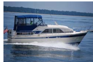
Phil & Patti on Sea Cabin